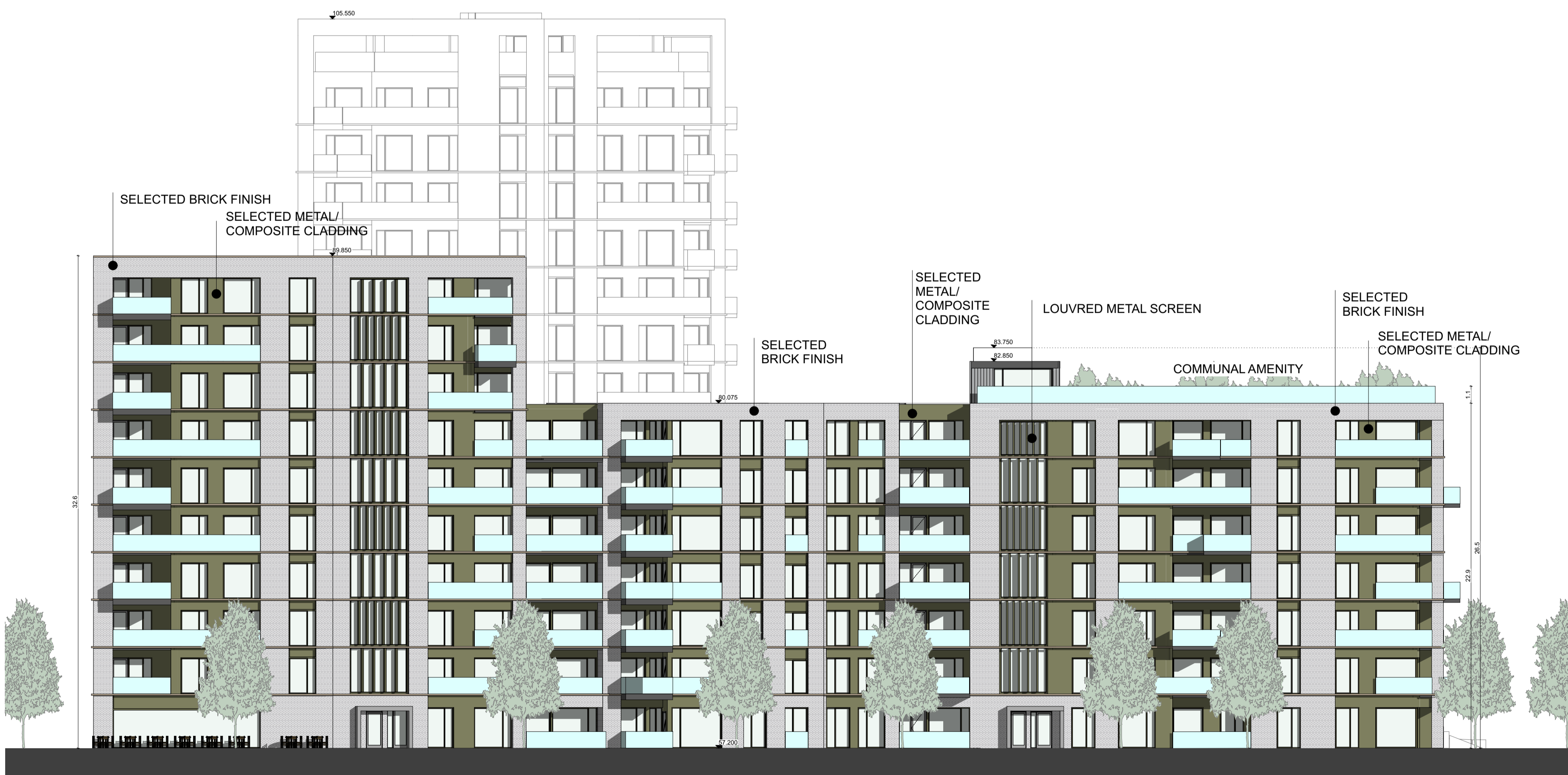
Elevation D-D SCALE : 1:200

NOTES WALL FINISHES TO BE BRICK/METAL/COMPOSITE CLADDING AS INDICATED. ROOFS TO BE GREEN ROOF TYPE. BALCONIES TO BE GLAZED.