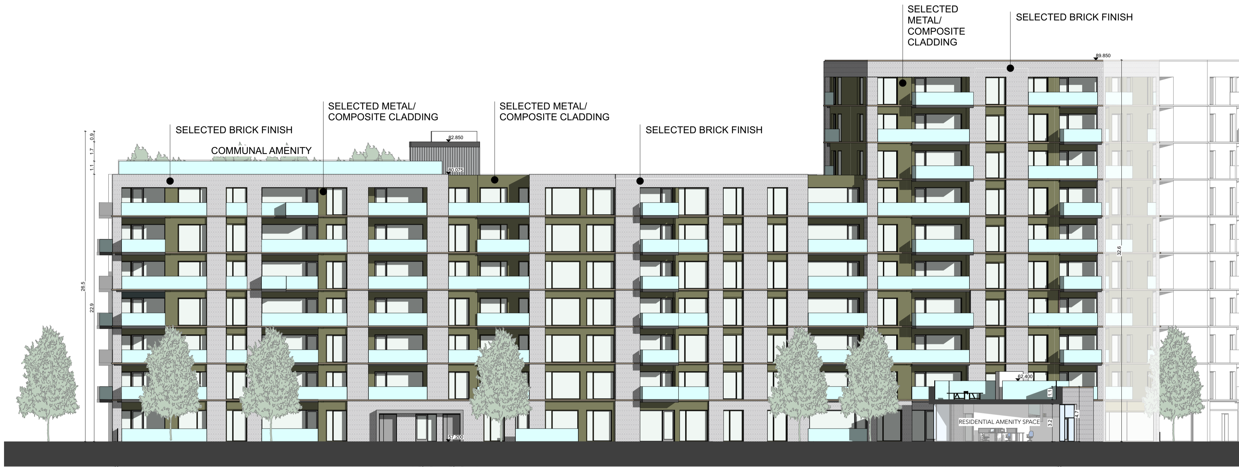
Elevation C-C SCALE : 1:200